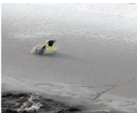
Fig. 3 An emperor penguin surfacing through thin ice at high swim speed to catch a single breath and continue swimming

Another possible reason for transmission loss is tag removal by the penguin. Tag removal can occur directly by: 1. birds preening their feathers (Kooyman personal observations), and/or 2. scraping off the tag under the ice (Cassandra Williams personal observations). In addition, tag removal can also occur indirectly by: 3. birds smashing through the ice to breath (Fig. 3), especially during March and April when new ice is forming (a condition which is possibly unique to this species), and 4. ice buildup on the tag [18]. All of these activities could have crippled the tag by breaking the antenna, the most vulnerable part of the tag and critical for data transmission. Finally, 5. the ice formation could have disabled the SWS, but there was no indication of periodic tag shut down. All transmitted daily for the tag duration. Consequently, determination of early transmission termination of tags that failed after 68 days at sea in regions other than the BofW is problematic. While the likelihood of predation is possible, wear and tear of feathers on the tag becomes more likely. Deterioration of tag attachment and the tag itself (antennae, battery life) is cumulative. Tags may have been damaged by the ice and/or fallen off due to the breakdown of feathers at the attachment site.