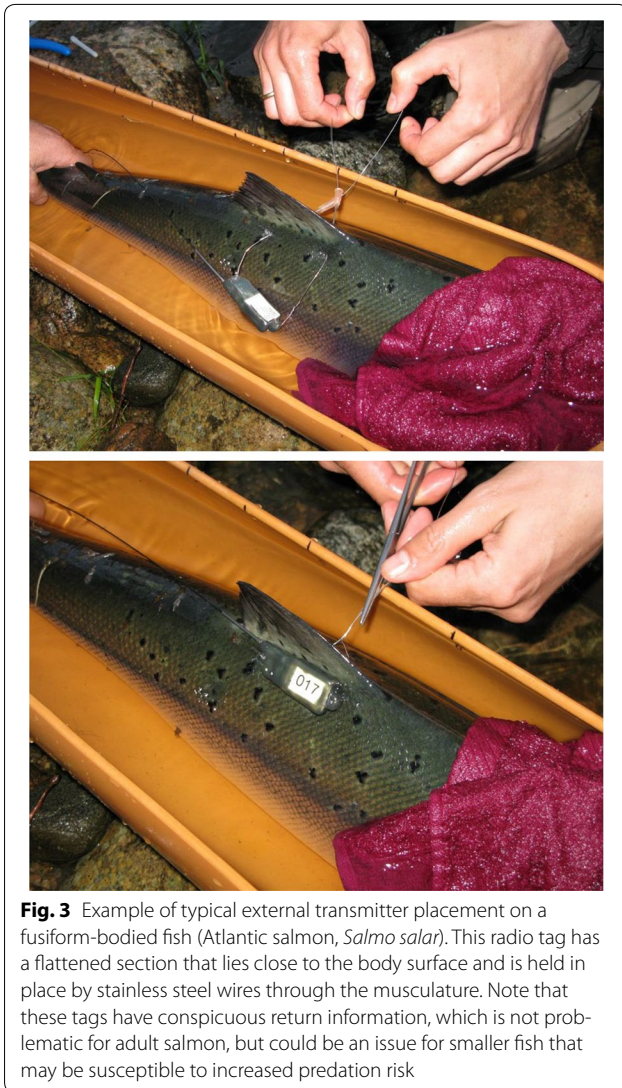
Fig. 3 Example of typical external transmitter placement on a fusiform-bodied fish (Atlantic salmon, Salmo salar ). This radio tag has a flattened section that lies close to the body surface and is held in place by stainless steel wires through the musculature. Note that these tags have conspicuous return information, which is not problematic for adult salmon, but could be an issue for smaller fish that may be susceptible to increased predation risk

tag retention. Tags must be attached snugly to the body to minimize the risk of entanglement/snagging, biofouling and to minimize drag. Several studies have reported problems with external tagging of sturgeon and catfish species. Collins et al. [29] used external radio tagging on shortnose ( Acipenser brevirostrum ) and Atlantic ( A. oxyrinchus ) sturgeons in a field study and found poor retention for both species. In a subsequent tank experiment, only one of 12 individuals retained the tag after 40 days [30]. They judged external tagging unsuitable for these species. However, Sutton et al. [31] tested different attachment methods on juvenile lake sturgeon ( A. fulvescens ) kept in tanks and reported that heavier suture material decreased transmitter loss, but the retention was still poor (75 % loss after 26 days). A subsequent test of different shapes of external tags resulted in loss of over